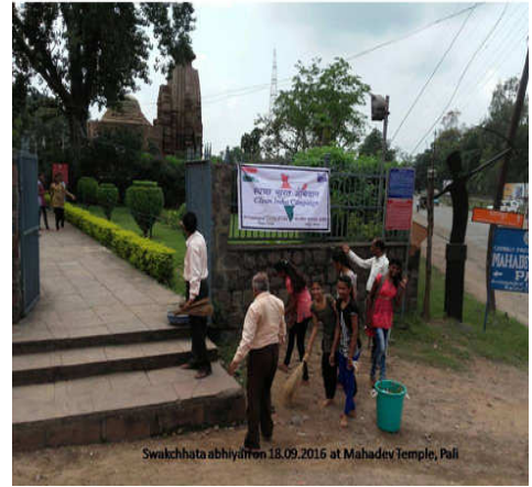
Swachhata abhiyan on 18.09.2016 at Mahadev Temple, Pali