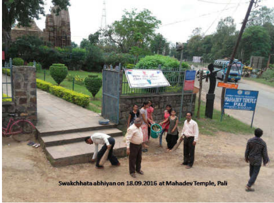
Swachhata abhiyan on 18.09.2016 at Mahadev Temple, Pali