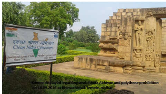
Banner displayed regarding Swachhata Abhiyan and polythene prohibition on 18.09.2016 at Bhimachik Temple, Malhar