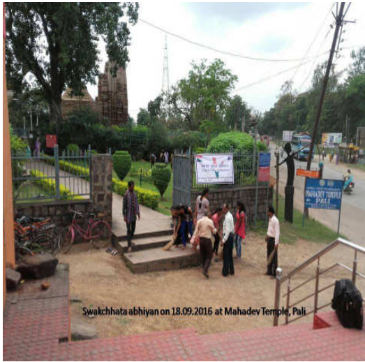
Swachhata abhiyan on 18.09.2016 at Mahadev Temple, Pali